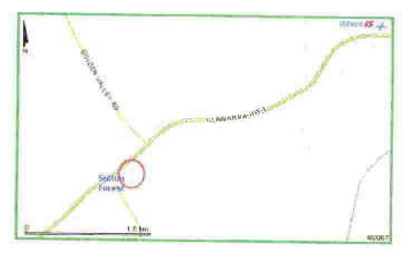
FIGURE 1 - Location Plan